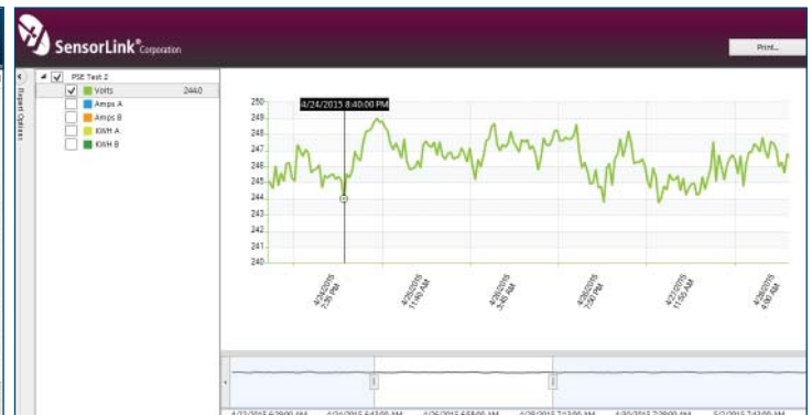
Steelhead for TMS: Graphing Screen