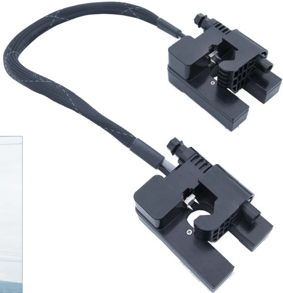
Overhead TMS deployment